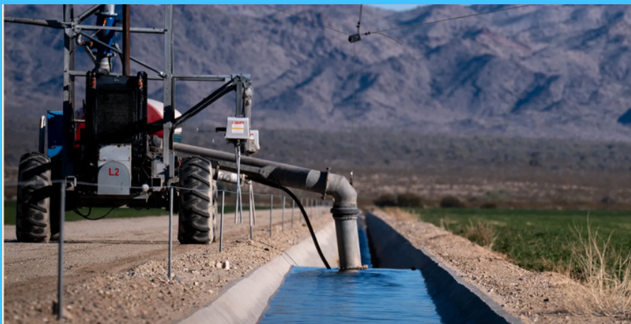
Groundwater is pumped into a canal to irrigate a field, Feb. 25, 2022, at Fondomonte's Butler Valley Ranch near Bouse.